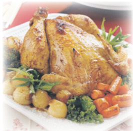
Bell & Evans Whole Fryers All Natural Product of the U.S.A.