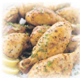
Bell & Evans Whole Legs Family Pack All Natural Product of the U.S.A.