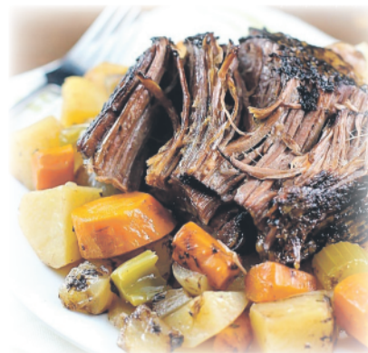
Piedmontese Chuck Roasts All Natural Product of the U.S.A.