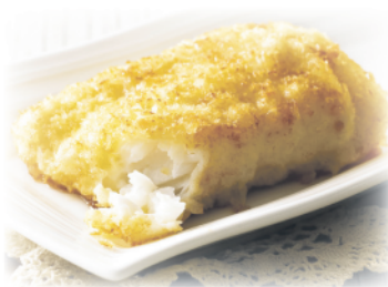
Fresh (Wild Caught) Lemon Sole Product of the U.S.A.