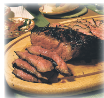
Piedmontese Chuck Steaks All Natural Product of the U.S.A.